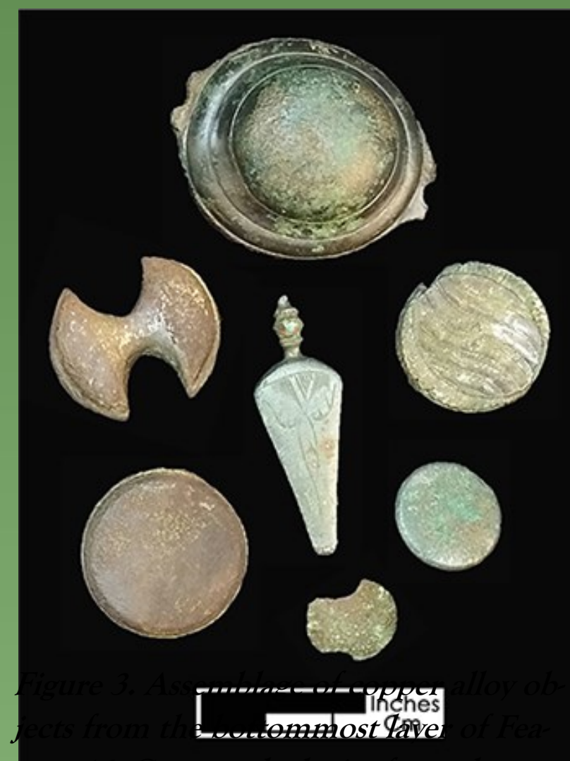
Figure 3. Artifacts around the spoon handle are a bridle boss for a curb bit, a decoration for a horse bridle, an unidentified boss, a sleeve button with some damage, a waistcoat or breeches button, and a decorative stamped button with a bone back. Other buttons were recovered at NAVAIR, but the bottommost layer of Feature 16 was the only place where horse tack decorations were found.

Museum (Figure 4). Archaeologists still don't know exactly why these spoons were engraved or how they were used, but motifs tend to resemble those found on carvings made in Africa and it is likely the spoons were decorated and used by slaves. They may represent divination tools or other objects of power such as Igbo ritual objects known as ofos (Samford 2007). Perhaps the NAVAIR spoon handle served such a purpose.