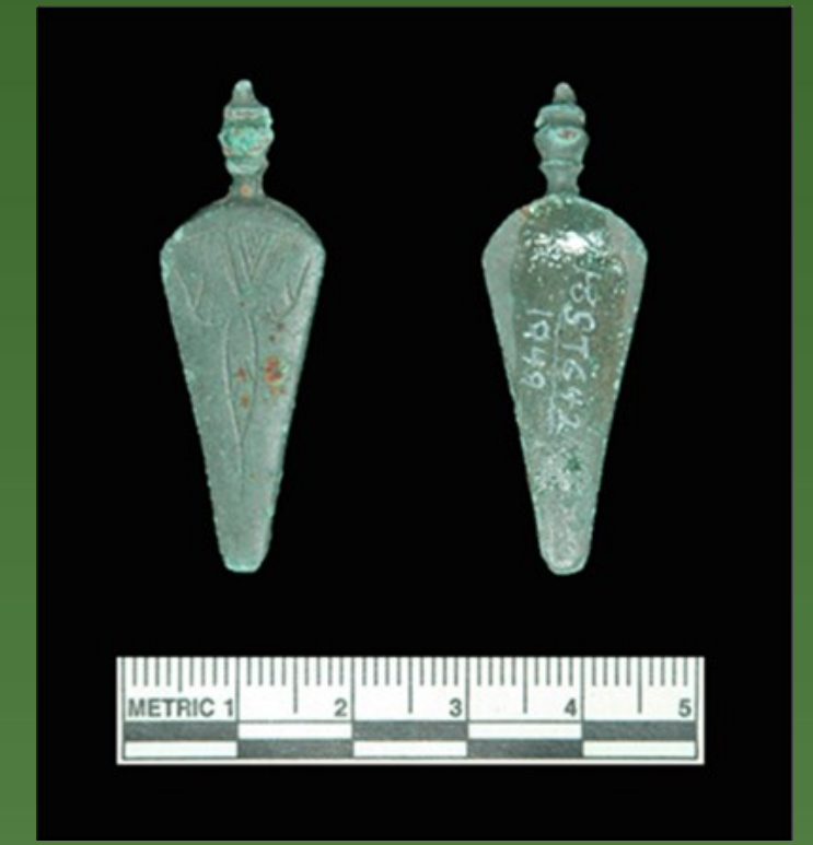
Figure 1. Engraved copper alloy object from the NAVAIR site, shown front and back (18ST642, Lot 170).

Museum (Figure 4). Archaeologists still don't know exactly why these spoons were engraved or how they were used, but motifs tend to resemble those found on carvings made in Africa and it is likely the spoons were decorated and used by slaves. They may represent divination tools or other objects of power such as Igbo ritual objects known as ofos (Samford 2007). Perhaps the NAVAIR spoon handle served such a purpose.